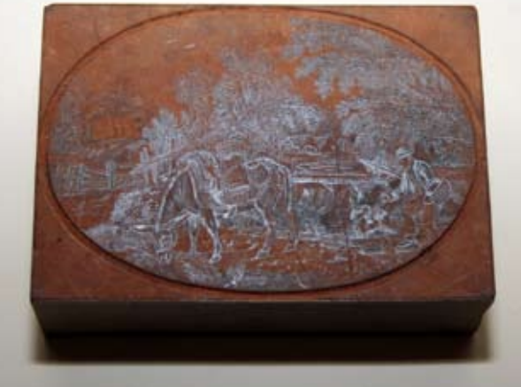
Two angled views of the block without the frame. The lead pencil marks reflect the light to show as white.

Favoured over time with offers of many choice items – amongst which were sets of vignettes on China paper, coloured drawings and pencil sketches – Edward Ford nevertheless declined the wood block. It was bought instead from Jane Bewick by the Pilgrim Street bookseller Robert Robinson, whose accounts for 2 February, 1859, show: Drawg on the Wood framed Fable cut, Ass Eating Thistles £2.2.0 [Workshop records in Tyne & Wear Archives, 1269/84]