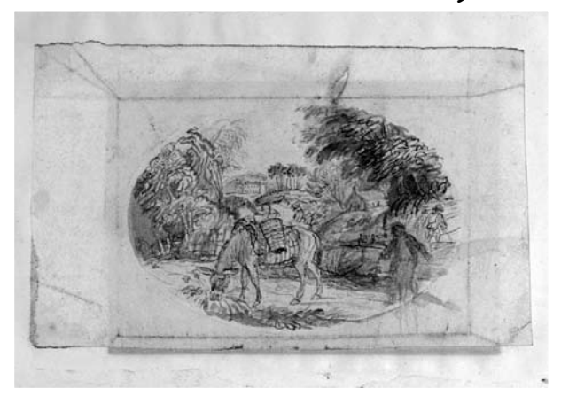
Pencil, ink and wash. Transfer drawing by Thomas Bewick.

The Georgian landscape, often with figures and animals, observed in the tiny vignettes scattered throughout Thomas Bewick's books, has gripped the imagination of successive generations of those interested in his work. The same often appears as a background to his headpiece figures. Let us consider one example: a mill with water-driven wheel in the middle distance; in the foreground, the familiar figure of a heavily laden ass, pausing for a moment, together with a fisherman and dog to one side. The miniature rural scene comes framed by swathes of broad-leaved foliage and a broken fence, a motif so common in Bewick's images as to be almost a signature.