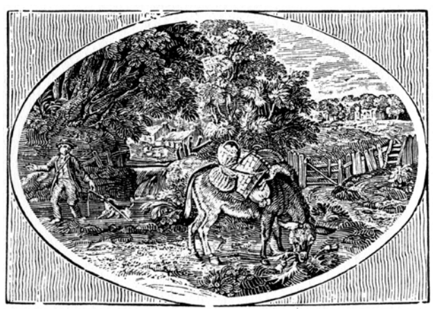
THE ASS EATING THISTLES, from Fables of Aesop , 1818, p.369, printed from the block cut by an apprentice in Bewick's workshop.